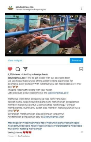
Figure 2. Instagram post 2

From the post above, posted February 24, 2021, which got 1.228 viewers, 84 likes and 1 comment (on July 18, 2021) and it got 95% better than recet post. The writer made a one minute video about the deer feeding activity and the deer's real situation with the back sound jingle serulingmas zoo, tagged some influential accounts and added a lot of hastags related to the content. Bilingual English and Bahasa Indonesia used for the caption and wrote three points that are usually used by @serulingmas_zoo, there are greeting, information and persuasive sentences.