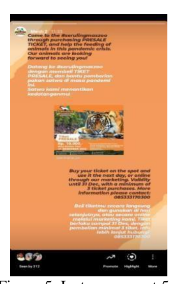
Figure 5. Instagram post 5

The post above was uploaded on Insta story on March 2, 2021, and got 312 views in 24 hours. Simple background used with the colour matched to the forward post in the middle of the post. The font used white, and black colour to defined the English, and Bahasa Indonesia promotion.