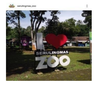
Figure 4. Instagram post 4

Four photos in different spots that was used in every slide to show the reader about the referenced place to take a picture. The writer used the same front angle to clarify those photos, and to make the reader imagine the placement before taking a photo.