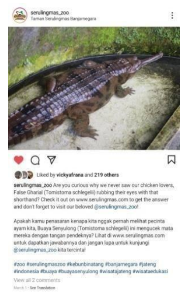
Figure 3. Instagram post 3

From the post above that was uploaded on March 1, 2021 which got 220 likes, and 2 comments. This post got 109 likes more than the previous post which used just only Bahasa Indonesia on the caption (on July 18, 2021), and got 80% better than the previous post. The writer made the short caption with the number of 37 words, and 239 characters in English, and 36 words and 280 characters in Bahasa Indonesia to make the caption simpler to make it easy for the reader to get the point but still get all the information. The hashtags for the international target and also the local target.