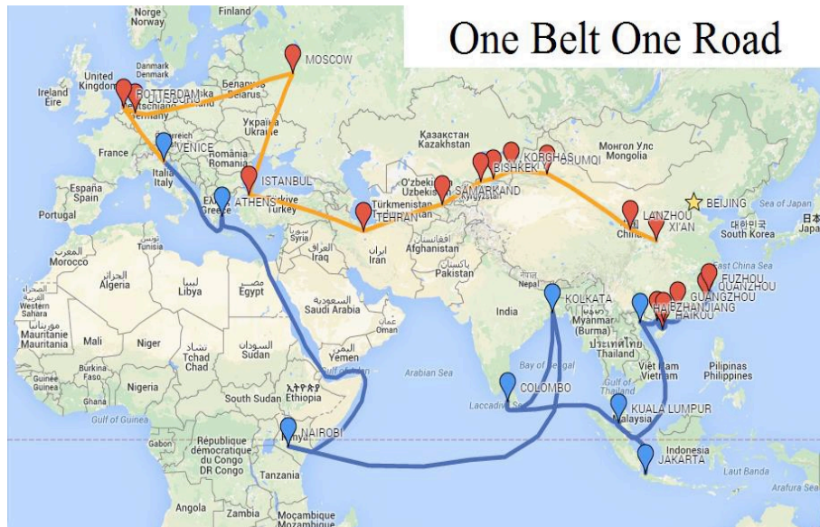
The map of "One Belt One Road" ( Xinhua version)

Indonesia is an important country for China to realize its dream. However, there is much controversy in Indonesia regarding this program. Although it is undeniable that this program will benefit Indonesia, the fear of foreign products and foreign workers' invasion has become one of Indonesia's doubts about accepting this program. It also considers that the prospect of increasing economic growth through this program is tremendous if it runs well. Therefore, this paper tries to find out more about the challenges and opportunities for Indonesia. This paper can then be used as a consideration for the governments of Indonesia and China in developing their policy toward this program.