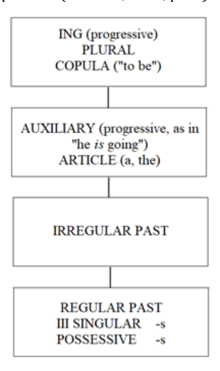
Figure 1. The Sequence of L2 Acquisition According to the Natural Order Hypothesis (Krashen, 1982, p. 13)

To investigate the acquisition of past tense forms among L2 learners, this EA study will test the hypothesis that irregular past tense is acquired before regular past tense, as proposed by NOH. Specifically, the study aims to compare the frequency of errors between irregular and regular verbs in past tense in written language among L2 learners. Therefore, the hypothesis of the study is that L2 learners will make fewer errors in the use of irregular past tense compared to regular past tense.