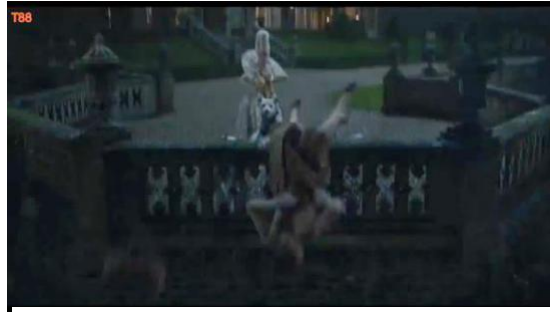
Cruella (2021), timestamp: 00.09.23

Catherine asked Cruella to stay in the car. However, it was not done by Cruella. The image in the data above shows that Cruella finally got out of the car, and Cruella accidentally ruined the party. Then, Cruella saw Catherine talking to a woman, then soon the Dalmatians came and pushed Catherine to the Cliff.