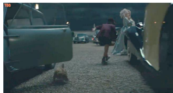
Cruella (2021), timestamp: 00.06.53