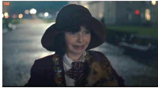
Cruella (2021), timestamp: 00.11.36

CRUELLA : I was an orphan. JASPER : You don't got that many options. Just us. ESTELLA : He was right. I was a fugitive. (ESTELLA SOBBING) Is she crying again?