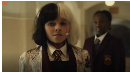
Cruella (2021), timestamp: 00.02.20

From the beginning, the inhospitality of society to Cruella has indeed been featured in this movie. Judging from the above datum, an old woman mentioned 'unfortunate' when seeing Cruella's condition with the two-coloured hair. Of course, the older adult thought that the condition was quite strange. Thus, the old lady looked with disgust and astonishment at the sight of baby Cruella. Cruella said in the initial narration that not everyone could appreciate Cruella's condition at that time.