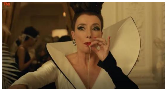
Cruella (2021), timestamp: 00.55.50

Consequently, Baroness's words returned to create turmoil and opposition inside Cruella. The reason is that Cruella loves Catherine, who is her mother. Thus, Cruella would certainly be annoyed if someone mentioned that her mother was a thief. Furthermore, the only thing that Cruella knew at the time was that the necklace belonged to her mother. Thus, a conflict arose between Baroness and Cruella in this incident. This conflict then provoked other conflicts. In the end, there is a conflict within Cruella, namely Cruella believes that her necklace was found and taken by Baroness, so Cruella must take back the necklace.