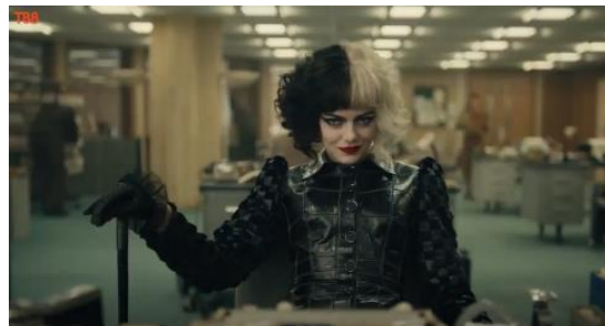
Cruella (2021), timestamp: 01.00.23

In the datum above, the first scene depicted Estella losing her mother; she was only crying. In the second scene, it depicted the moment Jasper offered Estella to steal with Jasper and Horace because Estella had no other choice; then Estella returned to tears. In those two scenes, it can be said that Estella has a distinct character. She always wept when she remembered her mother because she was a tender heart. She could not do much more than cry.