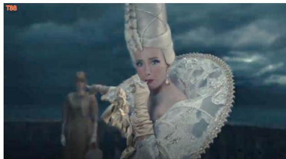
Cruella (2021), timestamp: 00.55.57 (flashback)