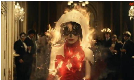
Cruella (2021), timestamp: 01.14.38

In the scene, it shows Cruella was at a party with her mother. Then she was ordered to stand still in the car and not try to get out. She consented to her mother's command until finally she was lured out to see a woman wearing fur and chiffon on her dress; this made Cruella with an appearance of awe, so she was curious to know more about the dress's shape. That thing finally caused Cruella to get out of the car and follow the woman. In the datum above, the researchers can say that one of Cruella's characterizations having a reasonably high curiosity. She even sacrificed a promise or commitment to her mother to remain in the car to satisfy her curiosity.