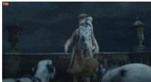
Cruella (2021), timestamp: 00.09.21