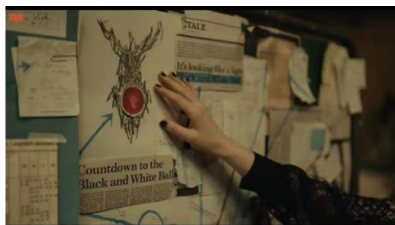
Cruella (2021), timestamp: 00.43.42

Cruella and Estella had smart thoughts. This smart characterization grows in the two personalities, both Cruella and Estella. This characterization can be seen from the various actions performed by Cruella. In some scenes, brilliant characterization is also shown with reactions from other characters who acknowledge the intelligence of Cruella and Estella.