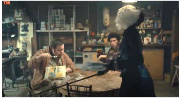
Cruella (2021), timestamp: 00.59.00

The datum above shows when Estella plans to retrieve Baroness's necklace. Estella's actions and dialogue show that plans are in full detail. Estella had even devised a strategy that would be used to steal Baroness's necklace. The above the datum describes Estella as intelligent, for everything she does must be carefully planned. In datum above, Estella sets up her strategy well on a chalkboard. To make sure nothing was left out.