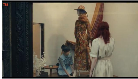
Cruella (2021), timestamp: 00.24.30

CRUELLA : I feel sad that you think that looks good. BOUTIQUE'S STAFF : What? CRUELLA : (LOUDLY) I feel sad you think that looks good.