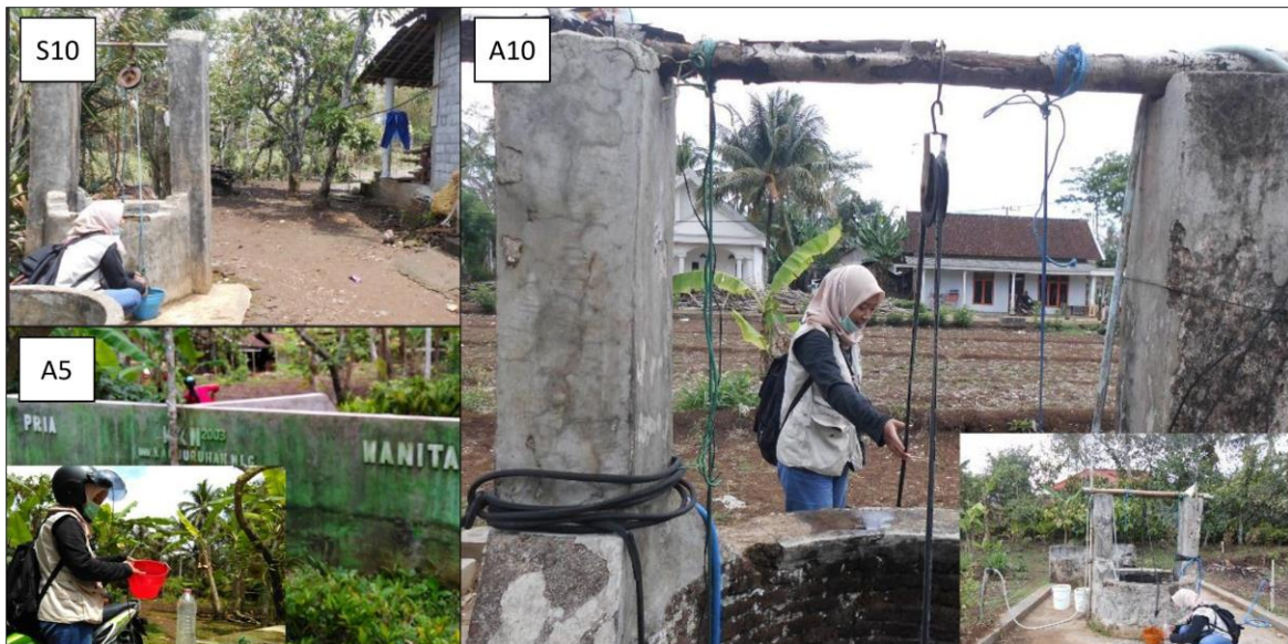
Fig. 1. Groundwater quality field sampling