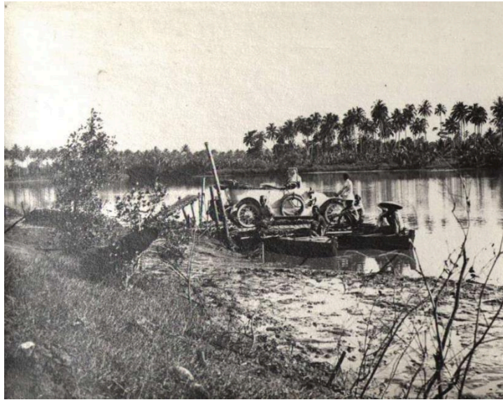
Figure 2. Ferry transportation on the Serayu River

cultural values. The government and local community actively organize various cultural events and festivals to promote and preserve traditional arts.