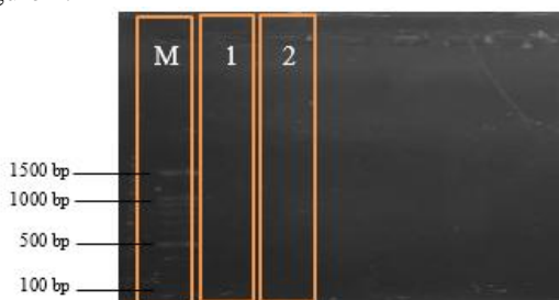
Figure 1. The visualization result of Dengue virus using RT-PCR method on agarose gel 1,5%.

The survey of adult Ae.aegypti was followed by molecular detection in order to know the transmission of CHIKV and DENV by their vector. Adult Ae.aegypti mosquitoes were collected using BG-Sentinel Traps and put them into microtube for the process of RNA extraction. The number of sample that used for this molecular detection were two samples (pools) for Sokaraja region and each pool includes 20 - 25 mosquitoes. It is in accordance with the research of Sari et al. (2012), which collected 20 mosquitoes each pool to detected Dengue virus using RT-PCR. Detection of DENV in this research was using Two-steps RT-PCR, where RNA of Dengue virus was converted into cDNA first. Product of cDNA then was amplified by RT-PCR that utilizes two universal primers (D1 and D2) with 511 bp amplicon size and followed by nested PCR using TS1-4 primer to know the specific serotype of Dengue virus (Organji et al. , 2017). The result of dengue virus detection after visualized on agarose 1,5% by using transilluminator is shown in Figure 1.