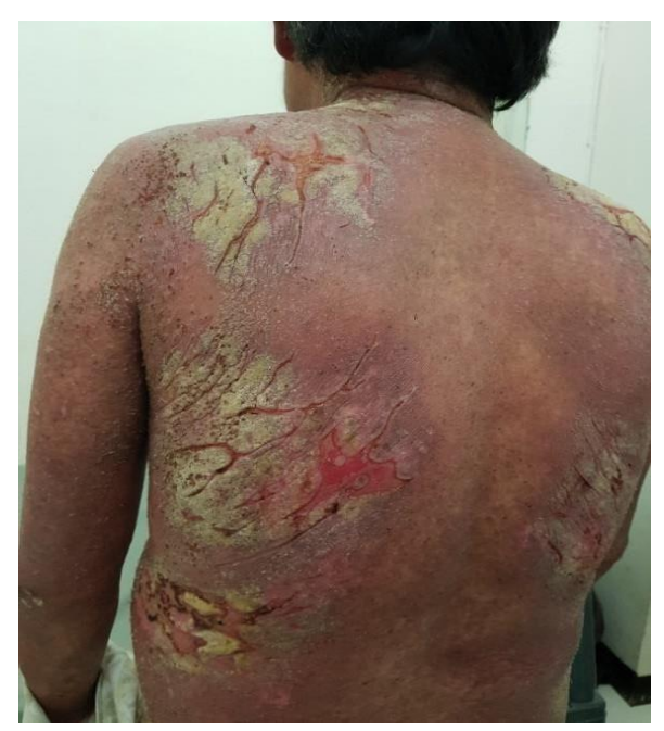
Figure 1. Unusual itchy and ulcerated skin plaques on the patient's trunk. Other skin was generalized erythematous.

This patient suffered about 3 times episodes of erythrodermic psoriasis, but at the last episode, he came with unusual hyperkeratotic plaques on his trunk that very itchy and ulcerated (Figure 1 and 2).