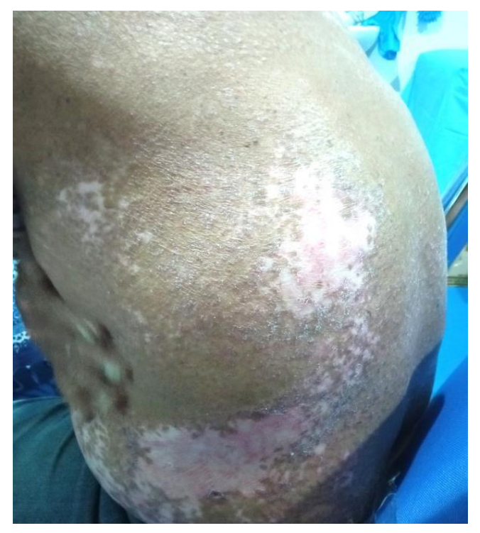
Figure 5. Post inflammatory hypopigmentation after combination therapy

In this case, the patient was confirmed histologically and diagnosed as psoriasis. He was treated with methotrexate and regularly controlled. After 5 years of methotrexate medication, he developed 3 episodes of erythrodermic skin condition and unfortunately we did not perform any skin biopsy and continued managing this patient as erythrodermic psoriasis. It might be one of the pitfalls in diagnosing CTCL. We noticed unusual plaques that very itchy and ulcerated on his trunk and thought out of the box to find another differential diagnosis by performing skin biopsy and peripheral blood smear to find Sezary cells.