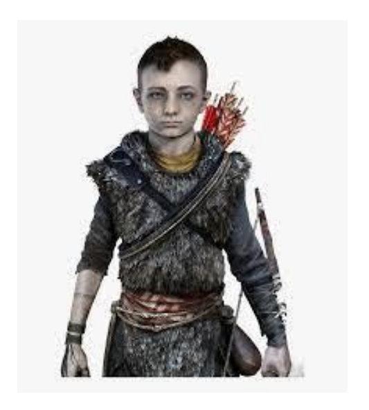
Figure 2.4. Atreus from God of War 2018

Kratos: What are you doing? Atreus: We have to help him. (Barlog et al., 2018, 2:51:08)