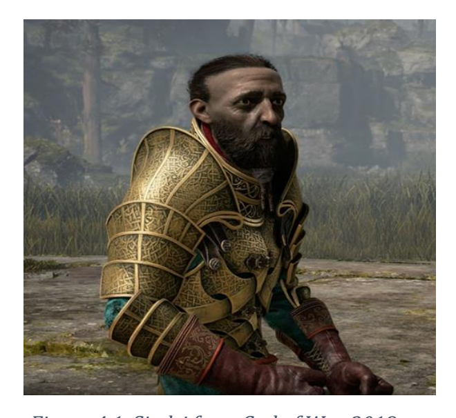
Figure 4.1. Sindri from God of War 2018

Sindri: I just need a tooth from that dragon. Watch where you grab tha... oh... never mind. So unclean. So, so unclean. Oh, the smell! Perfect, that should do. Ugh. Yeaaah... I'm not touching that. Just hold it out. (Barlog et al., 2018, 3:00:09)