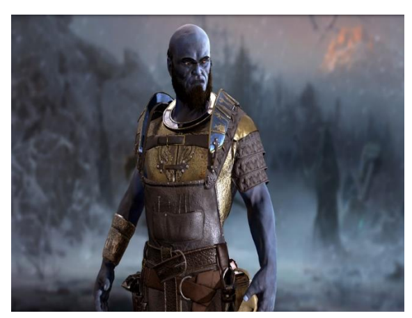
Figure 4.3. Brok from God of War 2018

Another type of masculinity is complicit masculinity. The males in this group are not necessarily hegemonic, but they do not challenge hegemony. The characters that fit this description are Brok, the dwarf blacksmith, and Sindri's brother. From his appearance alone, it is clear how the brothers differ from one another.