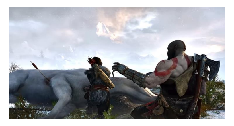
Figure 4.2. Kratos Trying to Comfort his son

As seen in the picture above, Kratos tried to console his son, but he could not. Instead of putting his hand to reassure his son, he retracted it back. This behavior is evidence of hegemonic masculinity at play. Kratos, the hegemonic man, is struggling to convey his care to his son because it is one of the characteristics of hegemonic masculinity. In an article written by Murnen et al. (2002), the themes of masculinity are resilience, aggression, and inexpressiveness. In this instance, this form of inexpressiveness prevents Kratos from bonding with his son. This is a recurring even it is in the game. However, that lack of emotion has an advantage, as proven in the following dialogue.