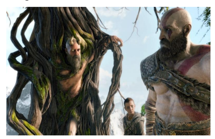
Figure 4.4. A picture of Mimir with Kratos and Atreus from God of War 2018

The last masculinity type in Connell's model is marginalized masculinity. The men in this category are unable to achieve or gain benefits from hegemonic masculinity. The reasons include being not of the same race as the hegemonic group or having some forms of disability. Out of all the characters in the game, the only one who seemingly matches the description of marginalized masculinity is Mimir, the Norse god of knowledge.