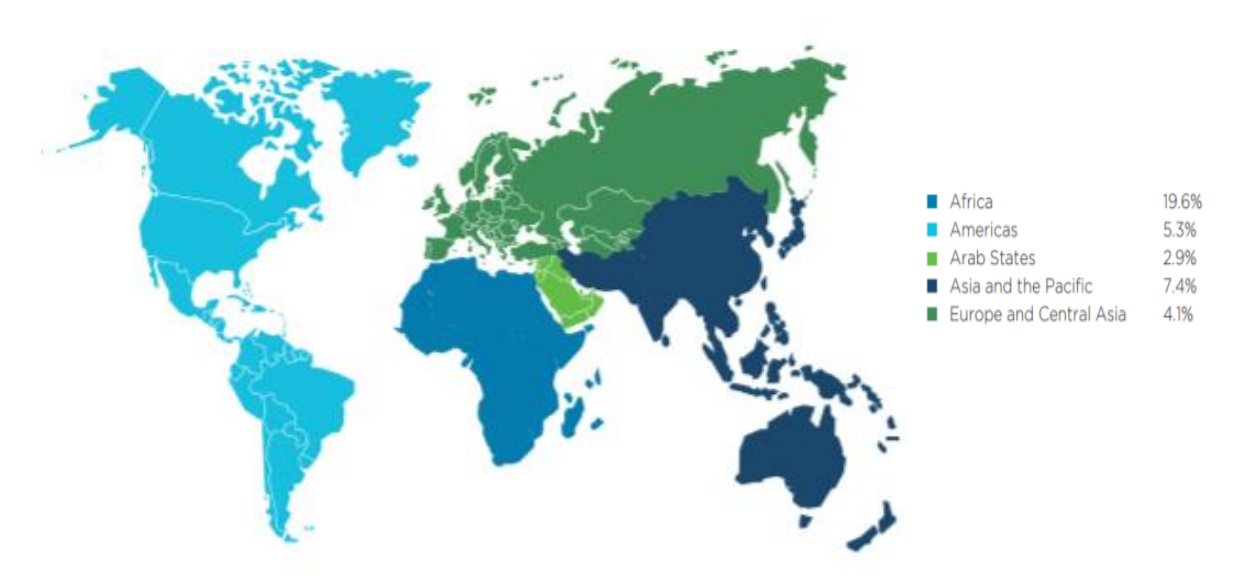
Figure 1. Regional Prevalence of Child Labor